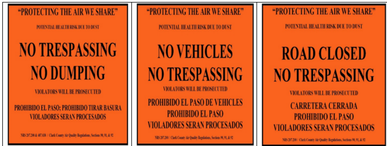
Figure 1: Examples of Signage

Note: The appropriate Control Measure for the project soil type must be selected from Table 1.