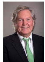
Commissioner Tick Segerblom