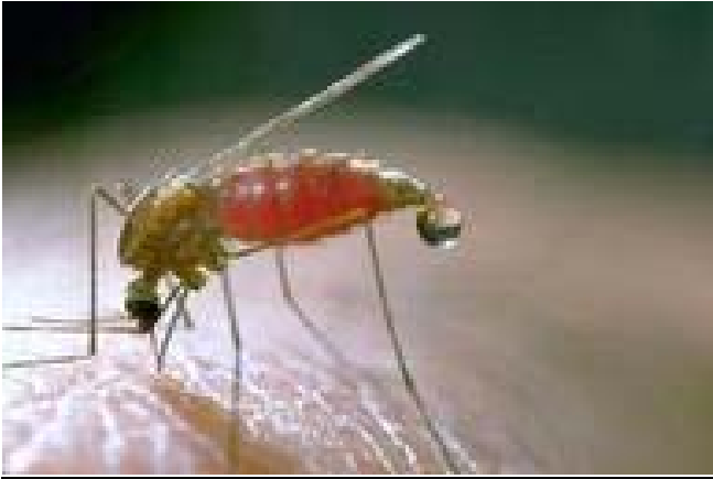
Female mosquitoes only take a blood meal!