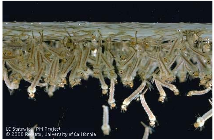
Culex mosquito larvae