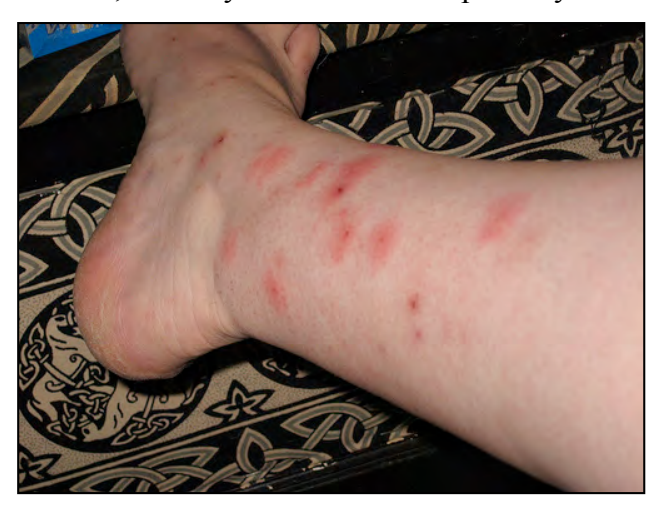
Bed bug bites on a woman's leg.

It is difficult, if not impossible, to distinguish bed bug bites from those of other biting pests without other circumstantial evidence that will link to a